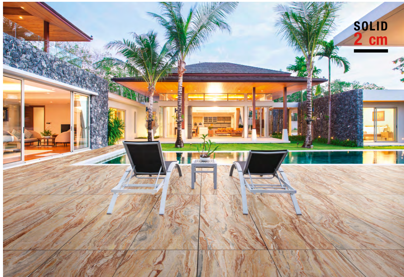
Floor: Orobico Red Solid 2cm 50x100