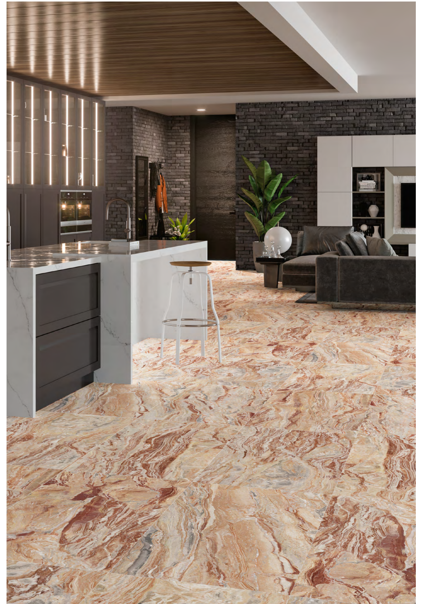
Floor: Orobico Red Polished 60x120

All sizes are rectified and without bevel edge finish. Todos los formatos son rectificadas y no biseñados. Tiles with random shade and aspect variation. Producto con alta variación cromática y desentonificación en composiciones.