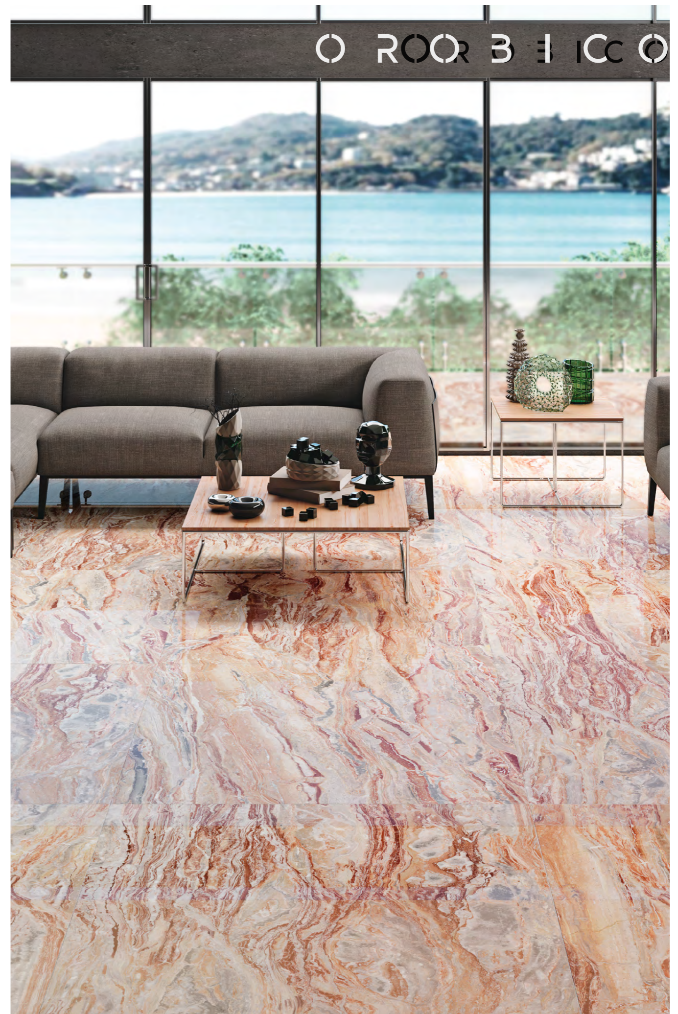
Floor: Orobico Red Polished 120x120