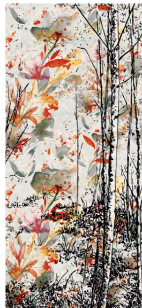
Instinto White Autumn Decor A+B